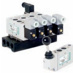
Gang Mounting Valves