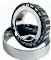
Tapered Roller Bearings