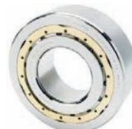
Cylindrical Roller Bearings