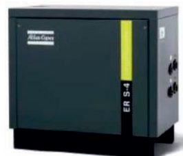
Energy Recovery (ER)