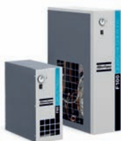
Refrigerated Air Dryer