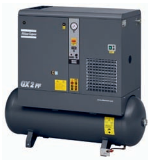
Oil Injected Air Compressors