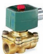
8030 Low Pressure