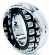
Spherical Roller Bearings