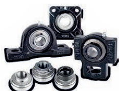
U Series Ball Bearing Housed Units