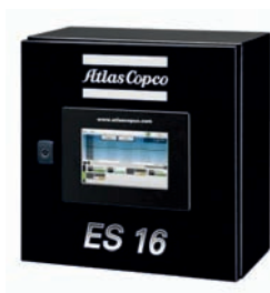
Energy Saver (ES)