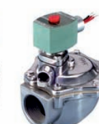
353 Dust Collector