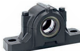
Plummer Block Housed Units