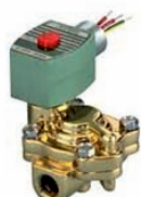
8221 Slow Closing