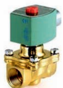
8210 General Service