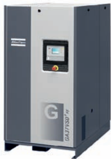
Oil Injected Rotary VSD Screw compressors