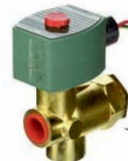
8223 High Pressure