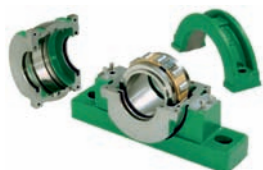
Split Cylindrical Roller Bearing Housed Unit